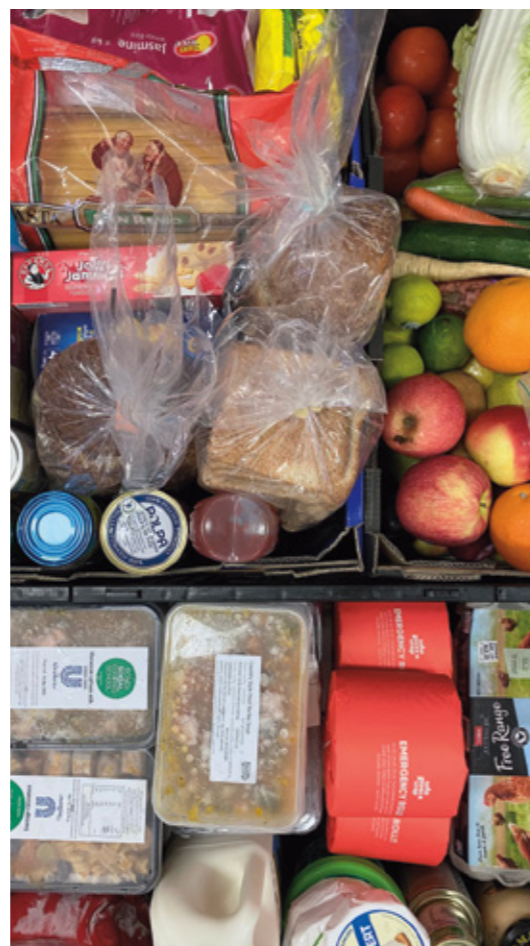
Insights and outcomes from this report will be launched to the public in due course.