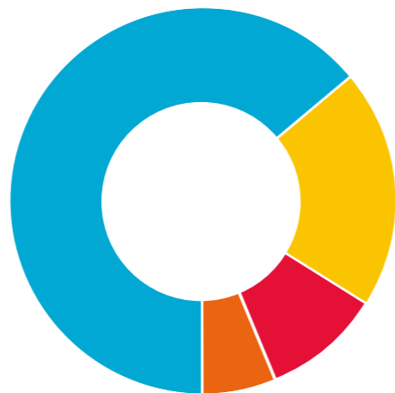
Expenses 2021 - 22