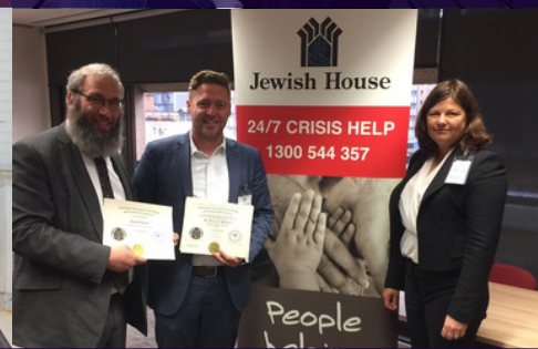
Jewish House Golf Day - 2011