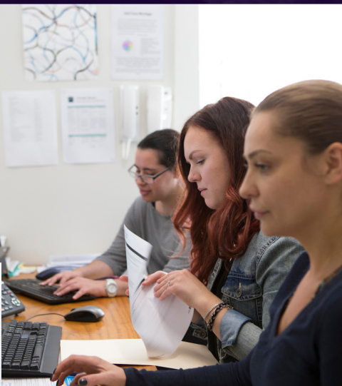
Student case worker program - 2016