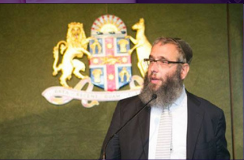
Rabbi speaks to Parliament - 2014