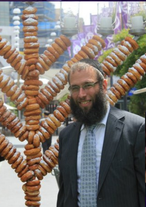
Rabbi hosting Chanukah at the Mall - 2012