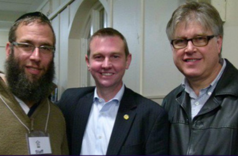
Homeless Sleep Out - 2011