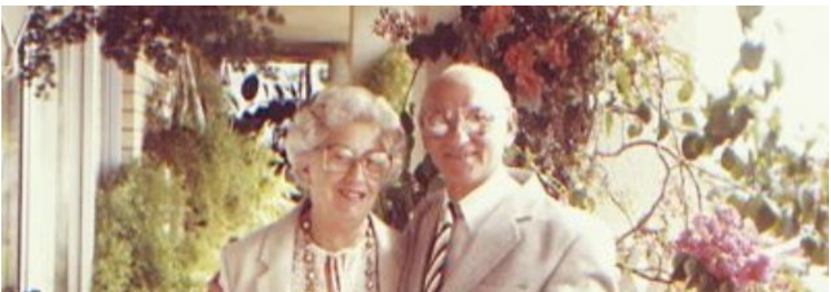
The Australian Jewish News, 19 June. 2010