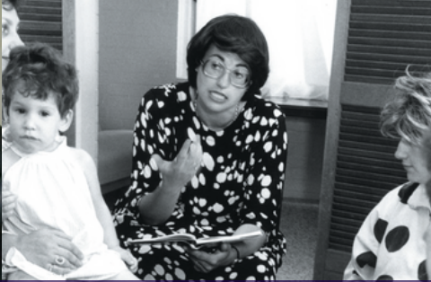
Parenting Group - 1980s