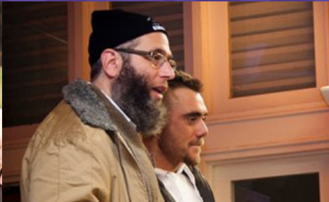
Homelessness Sleep Out - 2012