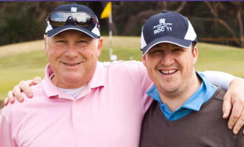
Jewish House Golf Day - 2011