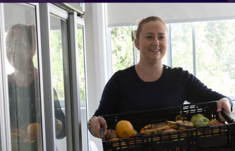
Staff preparing food for clients - 2016