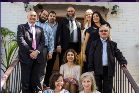
Jewish House Staff - 2014