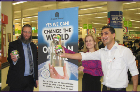
Coles Yes We Can appeal - 2012