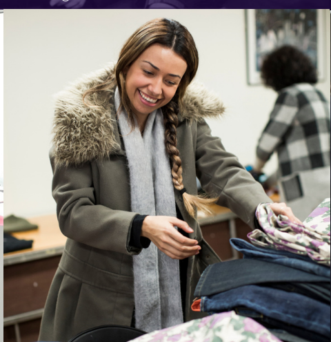
Clothing donation sorting - 2015