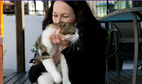
Client and her cat - 2017